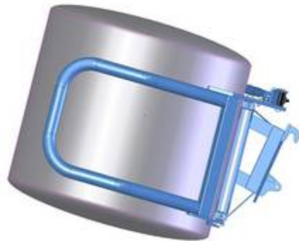
Figure 7. Correct transport position.