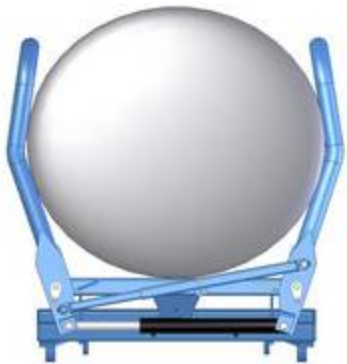
Figure 6. Grab arms closed.